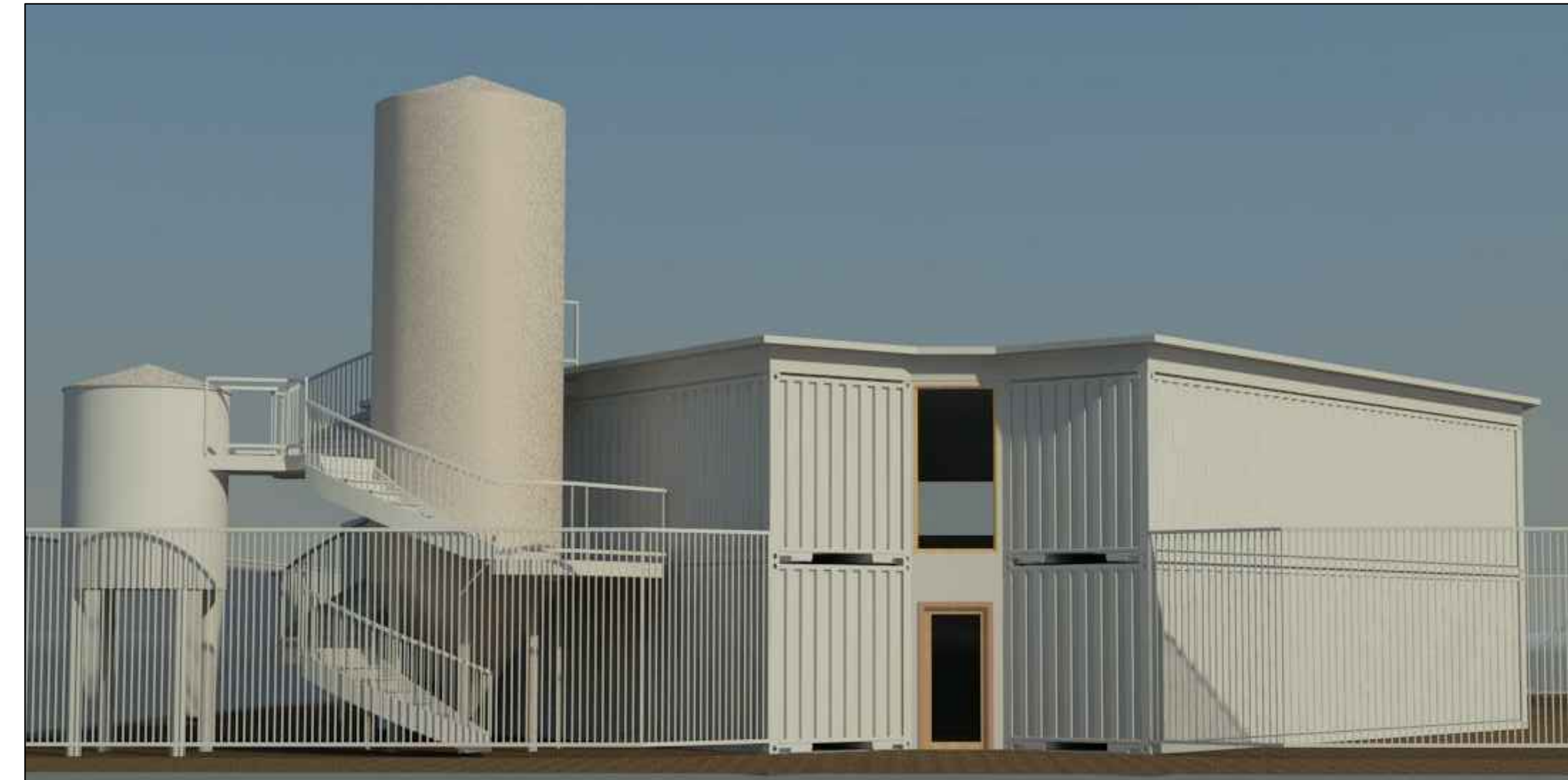
4 View from Bladensburg Rd Front Entrance