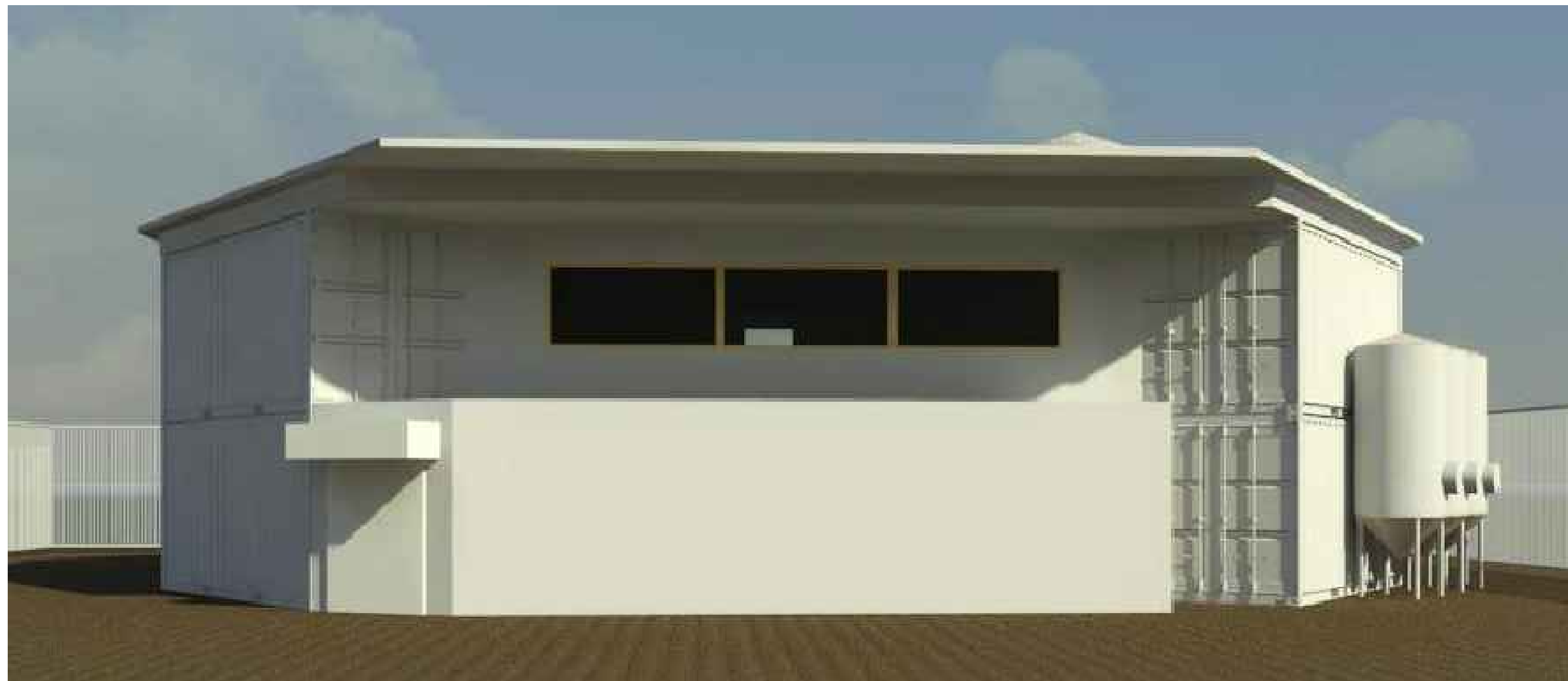
3 View from Back Summer Garden