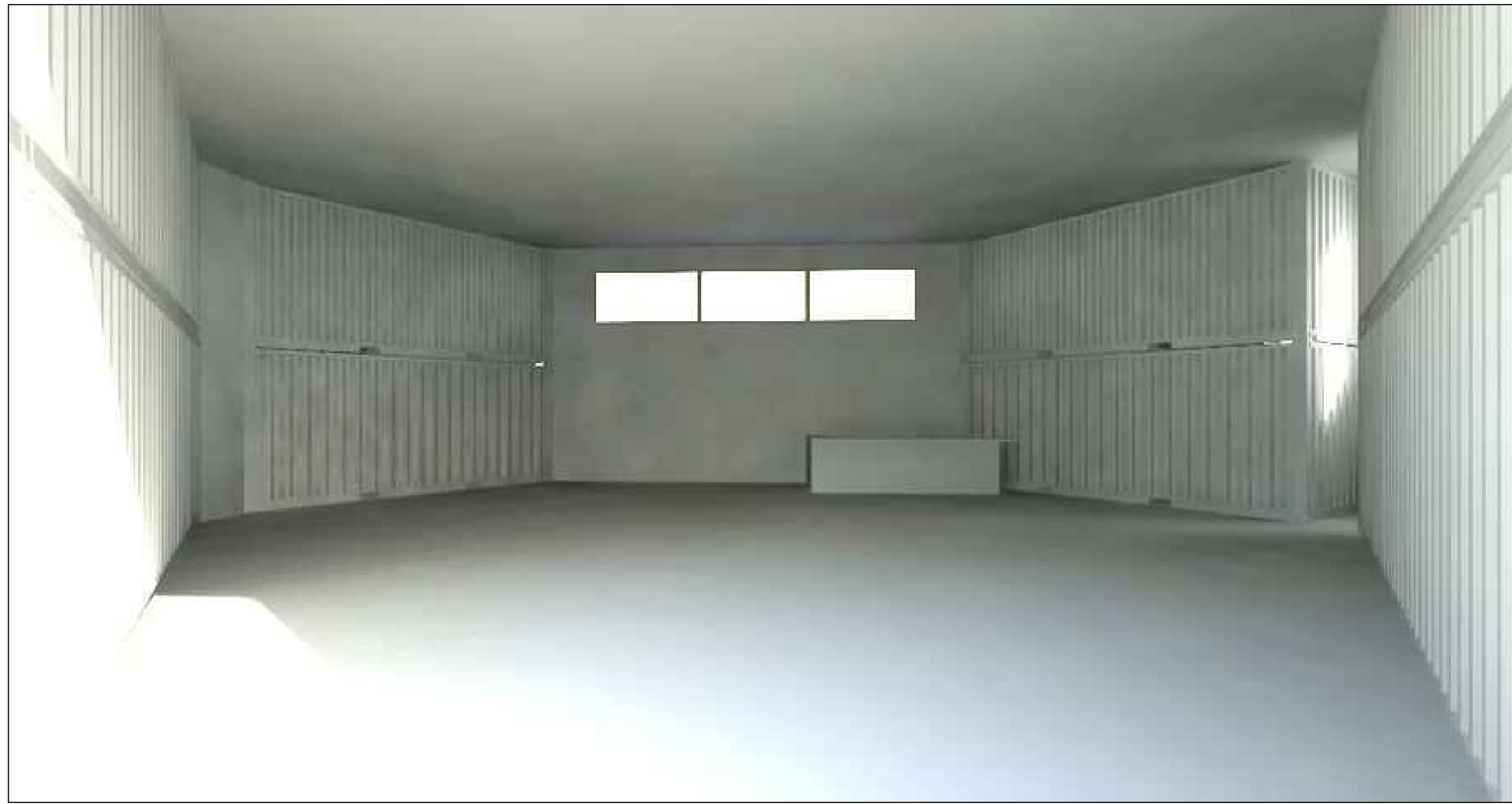
1 Interior View from Front Door