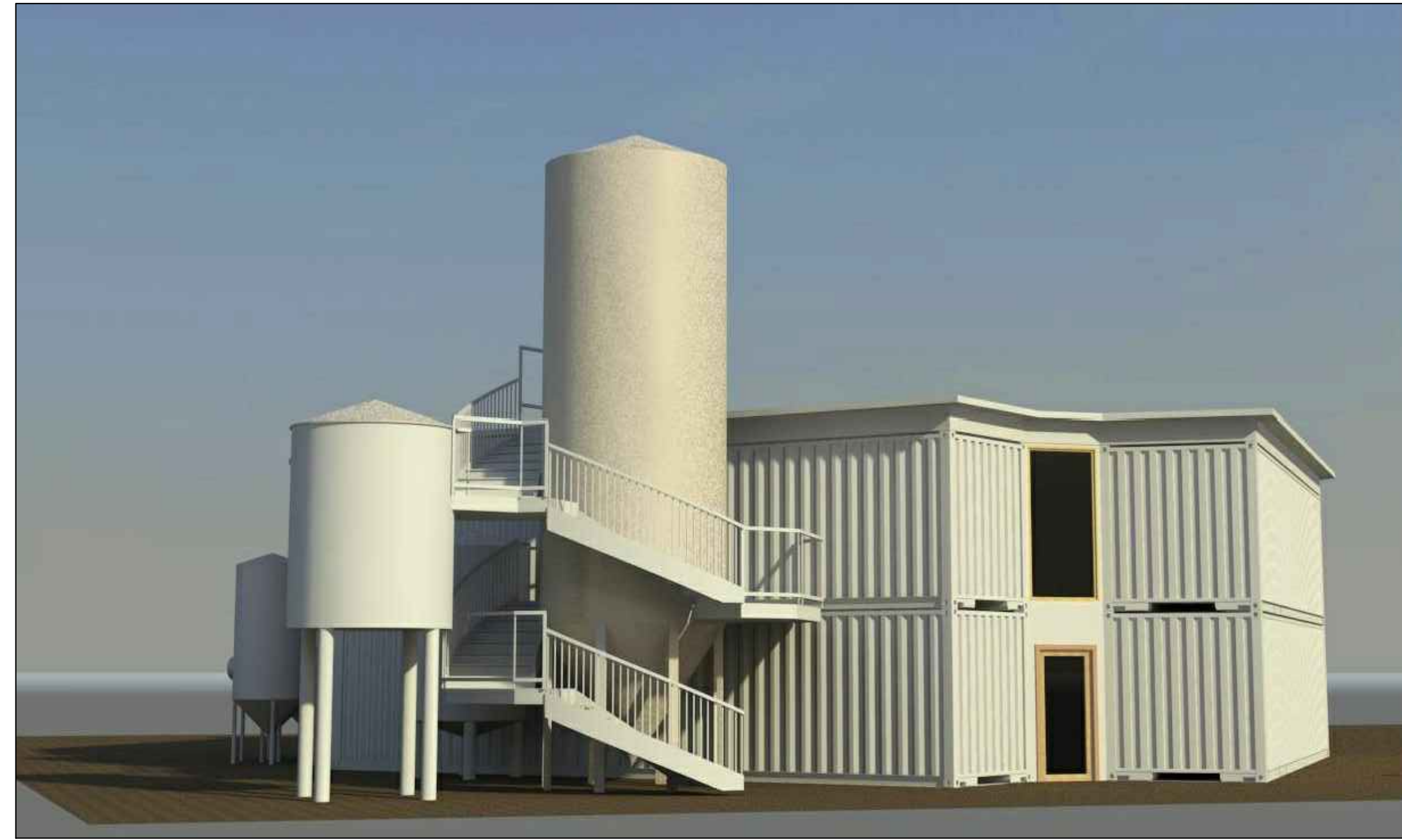
2 View from Corner of Bladensburg Rd & Meigs Place (Fence Removed for Clarity)